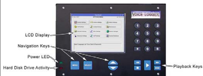
Total Recall VR LinX Omnia: Control Panel

All Specifications Subject To Change Without Notice