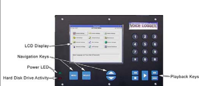
Total Recall VR LinX Neos: Control Panel

All Specifications Subject To Change Without Notice